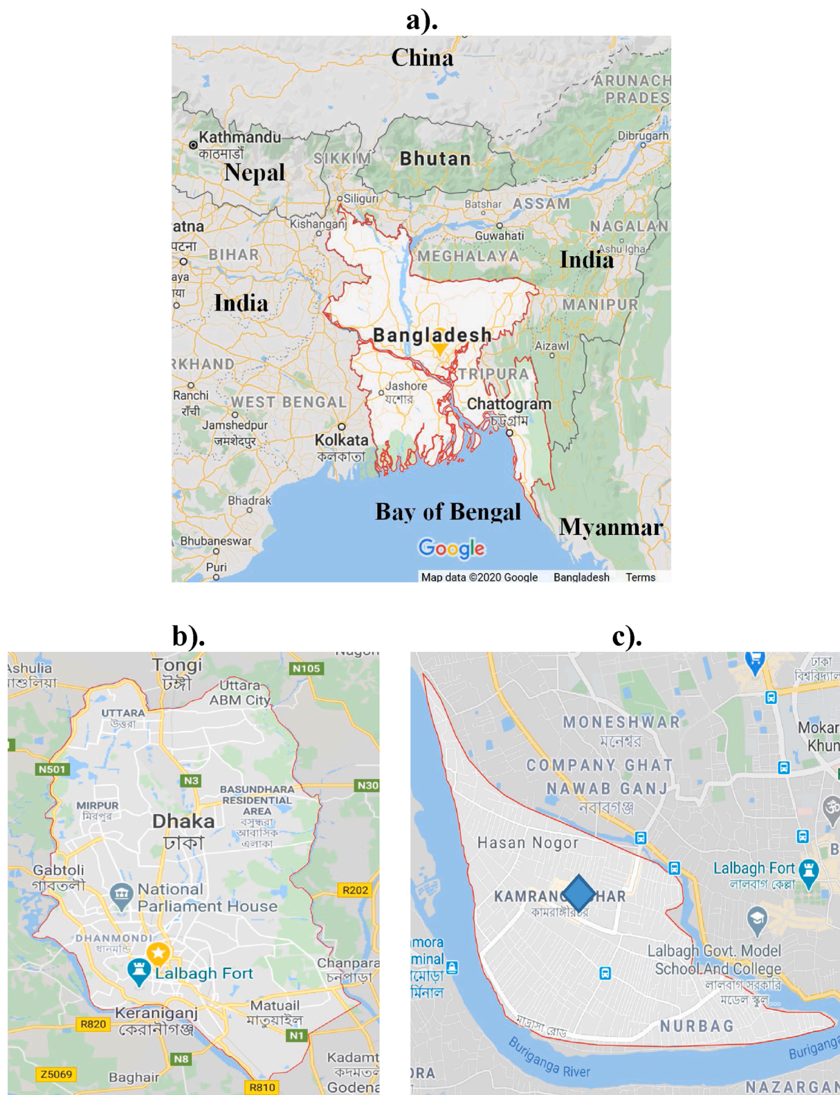
Fig. 1. a) Map of Bangladesh; b). Map of Dhaka Mega City, c). Map of the Plastic Industry location in Kamrangirchar [◆] Dhaka, Bangladesh.

between air pollution and blood clotting in the circulatory system. [5–8]. Air pollutants, inhaled or absorbed by dermal contacts in an industrial environment, usually contain several chemicals contaminated with heavy metals. Plastic wastes are being recycled in many developing countries especially in Asia, Africa and Latin America through some of the primitive methods and technologies which are not environmentally