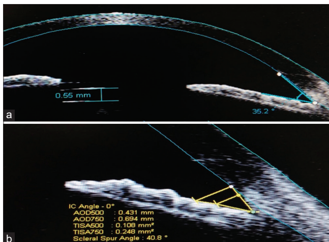
Figure 1: Postoperative anterior segment optical coherence tomography (AS-OCT) picture depicting ACD and Implantable Collamer Lens (ICL) vault (a) and anterior chamber angle parameters measurement (AOD500, AOD750, TISA500, TISA750, ACA and SSA) (b) AOD500: angle opening distance at 500 \mu\text{m} ; AOD750: angle opening distance at 750 \mu\text{m} ; TISA500: trabecular iris space area at 500 \mu\text{m} ; TISA750: trabecular iris space area at 750 \mu\text{m} ; ACA: anterior chamber angle; SSA: scleral spur angle

Preoperative IOP of 13.8 \pm 1.39 increased to 15.37 \pm 2.58 ( P = 0.021 ) and to 14.93 \pm 1.77 at 3 rd month ( P = 0.05 ). There was no significant difference between IOP at 1 st month and 3 rd month ( P = 0.61 ). Vault at 1 month was 0.60 \pm 0.06 and decreases significantly at 3 rd month to 0.58 \pm 0.05 ( P = 0.02 ). There was a significant negative correlation between the preoperative ACD and the IOP at postoperative 1 st and 3 rd month. The Pearson correlation coefficient between