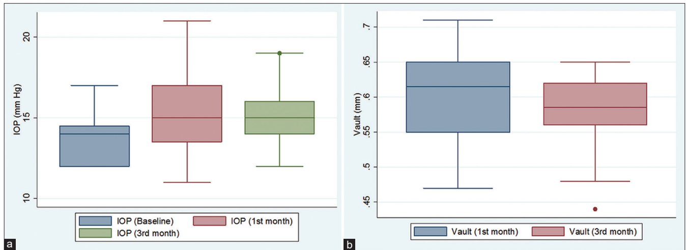
Figure 2: (a) Box whiskers plot showing the intraocular pressure at baseline, 1 st month and 3 rd -month postoperative period. (b) Box whiskers plot showing the ICL vault at 1 st month and 3 rd -month postoperative period