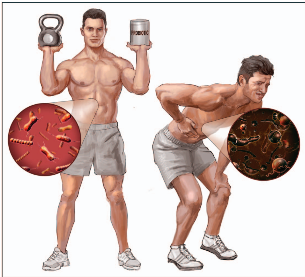
FIGURE 1. Supplementation with certain probiotic strains has been shown to increase gastrointestinal and immune health, improve nutrient absorption, speed up recovery, and improve athletic performance (illustration by Stephen Somers, Milwaukee, Wisconsin, USA).

exercise-induced gastrointestinal distress. Although it is generally accepted that a reduction in splanchnic blood flow is one of the main factors precipitating exercise-induced gastrointestinal symptoms, there are many other elements that contribute to different symptoms (e.g., nausea, vomiting, bloating, and diarrhea). To evaluate the effects of probiotic supplementation on gastrointestinal symptoms, circulatory markers of gastrointestinal permeability, damage, and markers of immune response during a marathon race, 24 recreational runners were randomly assigned to either supplement with a multistrain probiotic consisting of Lactobacillus acidophilus (CUL60 and CUL21), Bifidobacterium bifidum CUL20, and Bifidobacterium animalis ssp. Lactis (totaling 25 \times 10^9 CFU) or placebo for 28 days prior to a marathon race [9]. Although there were no differences in race finish times between probiotic and placebo groups, those in the probiotic supplement group were better able