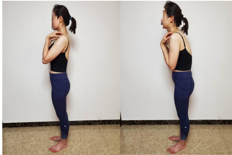
Fig. 1 Schematic drawing depicting the landmarks, the parameters and angles used in the measurements: a. the cranial center of mass, b. the posterior tip of the sacrum, c. the center of the femoral heads, d. the center of the knees, e. the center of the ankles ⊙ CSVA-S, ⊙ CSVA-H, ⊙ CSVA-K, ⊙ CSVA-A, ⊙ GCA, ⊙ GTA, ⊙ GLA

compare the radiographic parameters between postures. P < 0.05 was considered statistically significant.