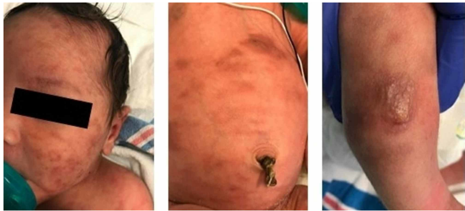
FIGURE 1: Photos of neonate with diffuse cutaneous lesions

Facial (Left panel), abdomen (Middle panel), and extremity (Right panel) lesions.