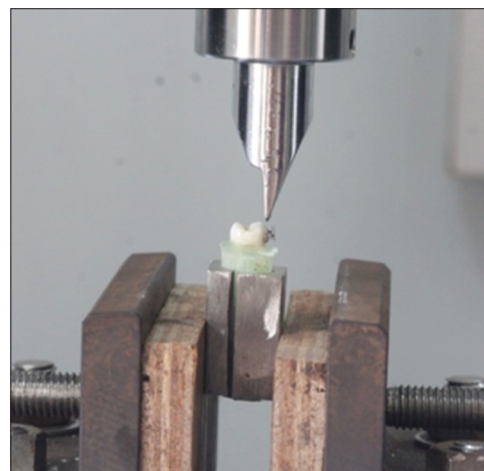
Figure 3: Testing of shearbond strength