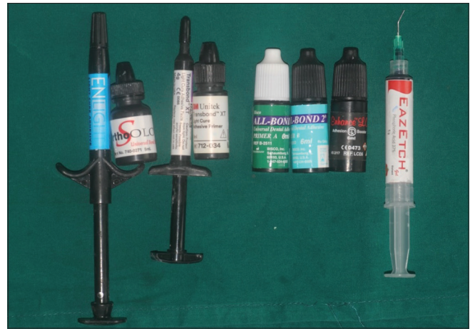
Figure 1: Bonding materials

In Group III, a thin layer (4–5 strokes with a brush) of Enhance LC was applied on to the etched dried enamel and