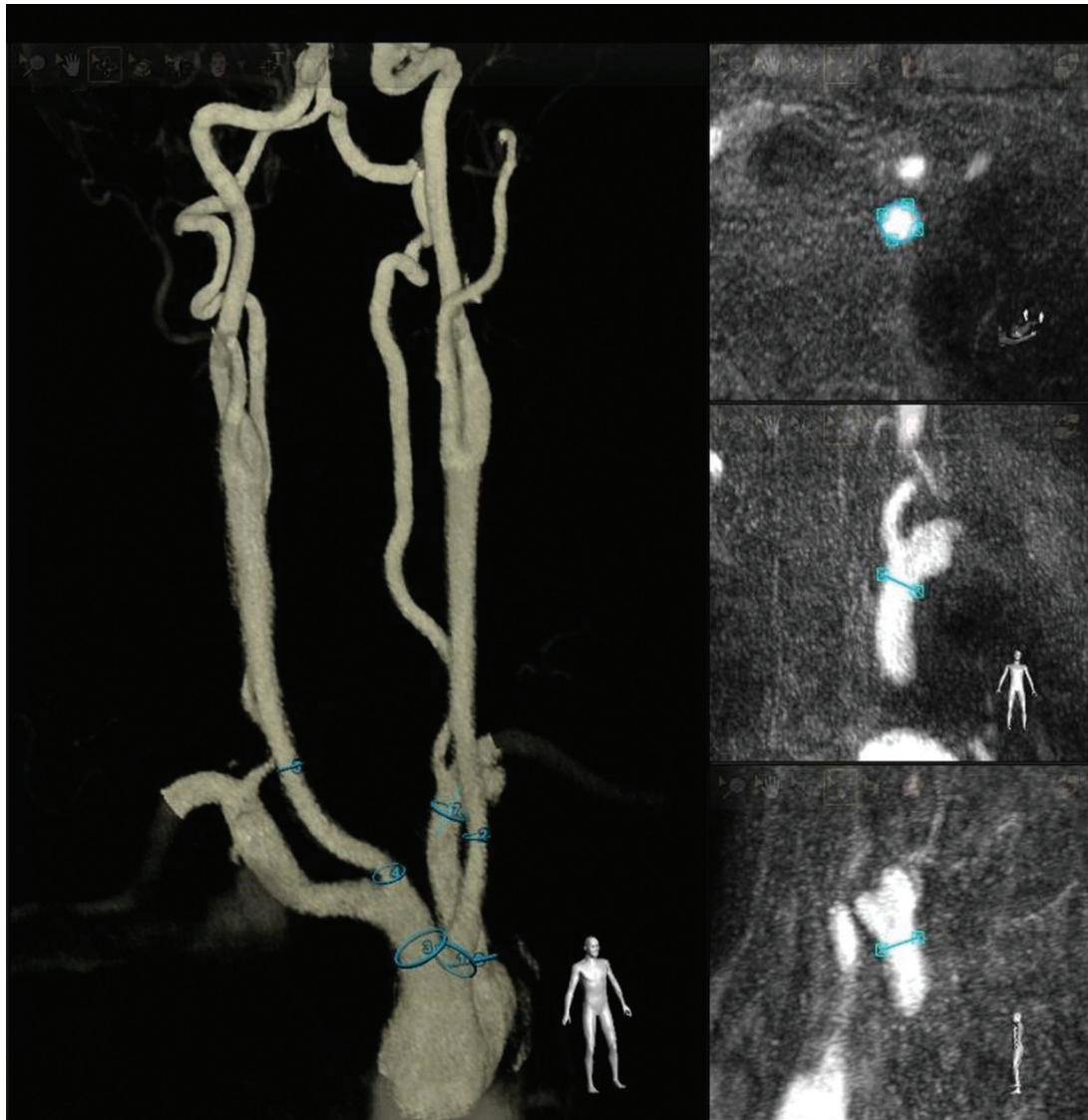
FIG 1. Example of a virtual roadmap of supra-aortic vessels. The vasculature is segmented from the MRA dataset with VesselNavigator software, with landmarks added on the brachiocephalic artery trunk, the right and left common carotid arteries, and the left subclavian artery. During this step, the operator saves projection angles, which can be recalled during catheterization.

the frontal C-arm. The image fusion was real-time, regardless of the C-arm position, magnification, or table manipulation. The first operator performed primary access by navigation of the catheter (diagnostic 5F or 6F guiding catheter or long introducer sheath) and guidewire from a femoral or radial access to cervical target positions. The operator was able to use, at his or her convenience, classic roadmap or augmented visualization to clear ostia and delineate vascular loops.