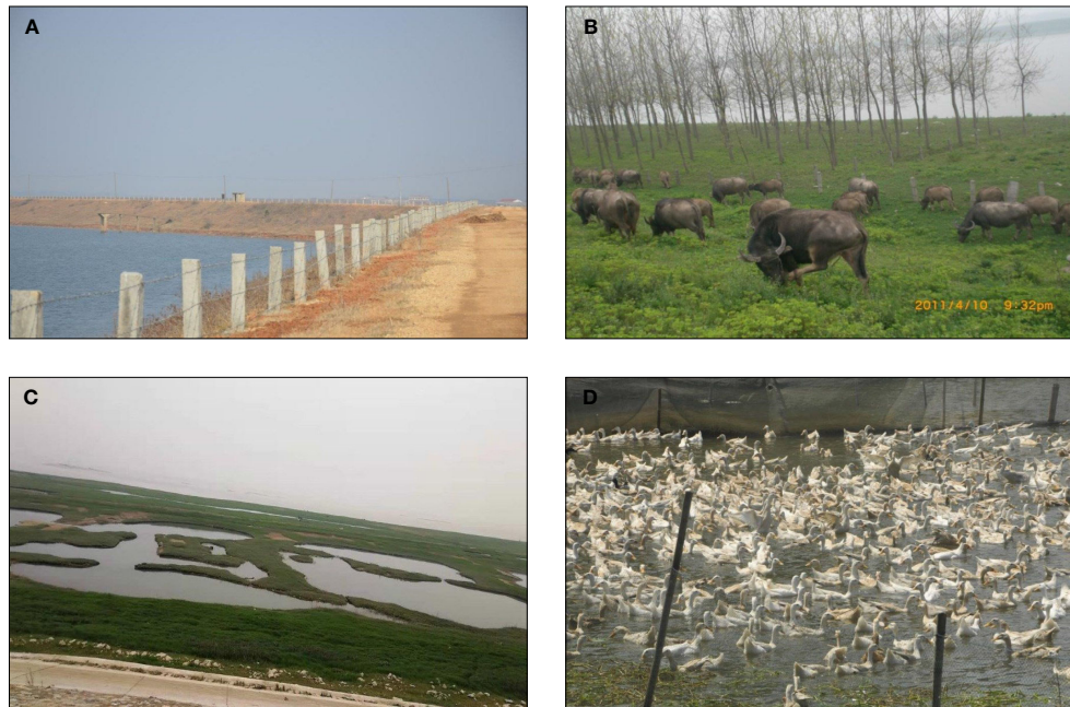
FIGURE 2 | Management of snail-infested areas in the Dongting Lake area, Hunan province, P.R. China. (A) Fences by a lake side area. (B) Buffalo feeding on pasture fenced off from a lake area. (C) Dongting Lake area after removal of domestic animals. (D) Raising poultry instead of domestic livestock animals.