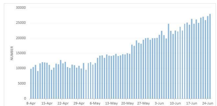
Figure 3: frequency of daily diagnostic testing of COVID-19 from 8 April to 26 June. (As 7 April, the number of cumulative COVID-19 tests was 211,136)

First, improvement in case-finding and high testing, which led to the increase in the number of daily cases from about 10,000 in early April to about 25,000 in the second week of June (Figure 3). In Iran, like most countries, the official daily reports of the disease are based on the confirmed laboratory cases. Since there was a limitation on PCR testing in Iran in the early weeks, as most other countries, the priority was to perform tests on hospitalized patients. From 11 April 2020, and after developing the country's testing capacity, the testing was scaled up to the community setting, which affected the epidemic curves of Iran. If the ability of the health system in testing was more during February to May 2020, it was expected that the first peak of the epidemic had more cases than what was observed, and its time was getting a little ahead or behind. With the assumption of no change in the severity of the disease, we expect to see the same proportion of outpatients and inpatients over the first wave of the epidemic as well. Therefore, it is anticipated to see no change in the general pattern of the first and second waves, and it is estimated to observe two separate waves still unless the first wave had been much larger than the official's report.