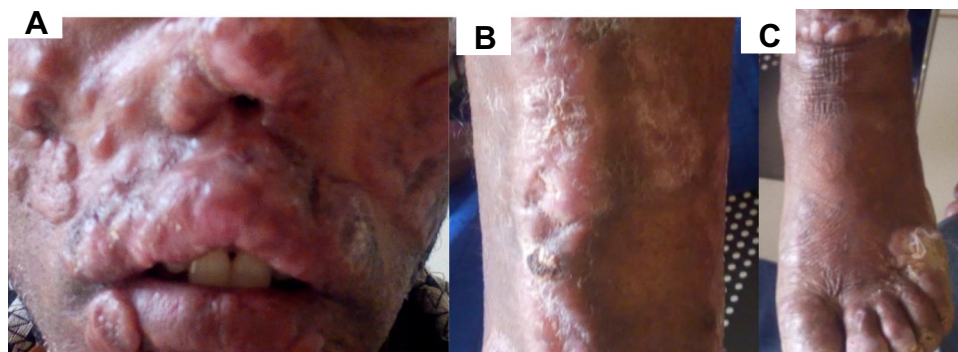
Figure 4 DCL. Affecting the face (A) and leg (B and C).

L. aethiopica is responsible for about 99% of CL cases in Ethiopia. 15 It is a pleiotropic species and has different genetic multiplicity, that diverse clinical forms could be manifested based on the infecting strain. 6,16 However, in Ethiopia, LCL