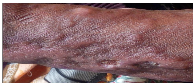
Figure 2 Disseminated CL. Affecting hands with characteristic multiple nodular lesions which crust at the center.

Leishmaniasis was suspected and he was sent to Amhara Public Health Institute, Bahir Dar City for parasitological investigation. Skin lesions were collected aseptically from nose, face and hands, and processed for parasitological examination. A smear was prepared directly from the