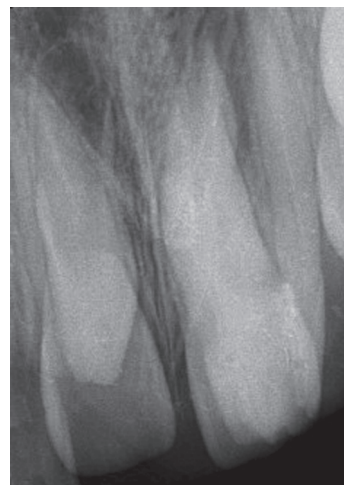
Fig. 2: Periapical radiograph shows two supernumerary teeth above two impacted maxillary permanent central incisors