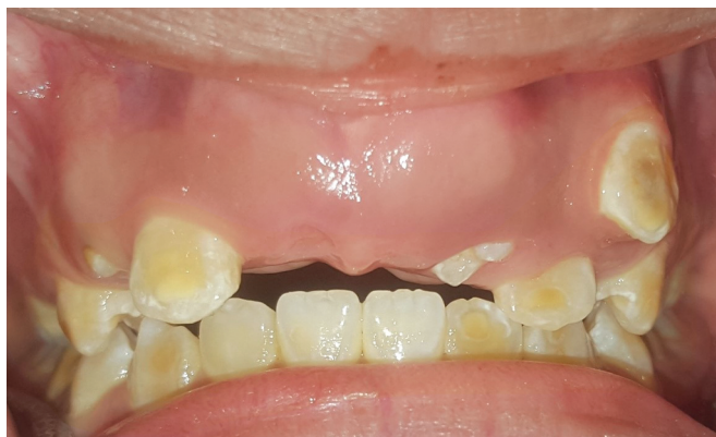
Fig. 1: Intraoral view showing the missing permanent central incisors, partially erupted supernumerary tooth in left maxillary permanent incisor position, bugle above the incisor area