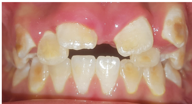
Fig. 8: Clinical photograph showing erupting maxillary central incisors after 6 months of the operation