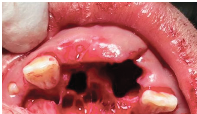
Fig. 5: Surgical site after extraction of erupted supernumerary teeth