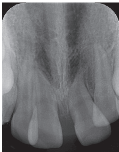
Fig. 9: Periapical radiograph 6 months postoperative showing the erupting two permanent maxillary central incisors