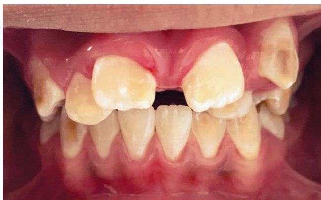
Fig. 10: Clinical photograph showing erupting maxillary central incisors after 1 year of the operation