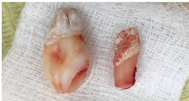
Fig. 7: Extracted supernumerary teeth