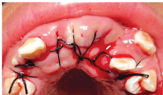
Fig. 6: Sutures in place

the supernumerary teeth were extracted without exposure of the unerupted incisors (Figs 4 and 5). Hemostasis was achieved, and the flap was repositioned (Fig. 6). Gross examination of the removed supernumerary teeth revealed that one resembled central incisor and was diagnosed as supplemental, while the other one had unusual crown and root morphology (multiple cusps in the crown, incomplete root development, deep pit on the palatal surface, greater buccopalatal dimension, and dilated root) and appeared like tuberculate supernumerary with dens invaginatus (Fig. 7). After a period of 6 months, clinical and radiographic examination showed that upper permanent incisors erupted on its own without any intervention (Figs 8 and 9). One-year follow-up showed advanced