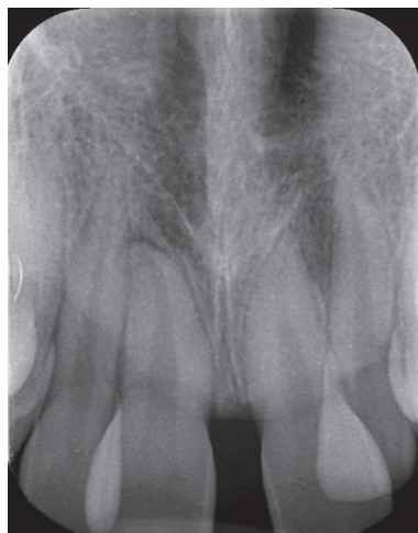
Fig. 11: Periapical radiograph 1 year postoperatively showing the eruption of two permanent maxillary central incisors

There is controversy regarding the appropriate time for mesiodens removal. Mason et al. suggested that earlier removal of obstruction before maturity of adjacent incisor tooth increases the opportunity of spontaneous eruption, they observed spontaneous eruption of 72% of immature incisors have been occurred after early extraction of associated obstruction, while 63% of mature ones required