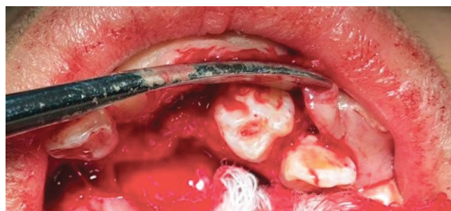
Fig. 4: Photograph shows the impacted supernumerary tooth after raising the buccal and palatal flap