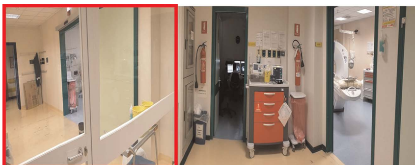
Figure 2. CT scan area, in red dedicated COVID19 CT.

To limit cross-contamination between “clean” and “dirty” environments and operators, communication between the in-theater staff and the assisting staff outside the OR is provided