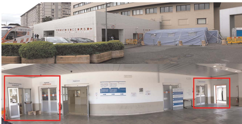
Figure 1. Patient entry area in the emergency room, in red COVID19 pathways.

the so-called asymptomatic COVID-19 cases. For this reason, we early decided to treat surgical red code emergency and major trauma patients under maximal COVID-19 precautions (including OR) until proven negative.