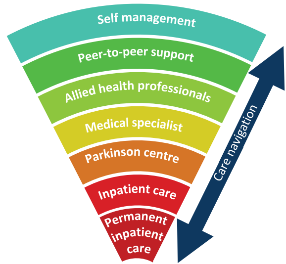
Fig. 2. Connecting all different layers of health care to ensure patient navigation.

The second element is patient navigation which we define as an integrated service delivery to proactively guide and support patients through the complex health care system, referring them timely to the appropriate health care provider [34]. Fragmentation of care is a key factor limiting the efficacy and quality of healthcare delivery [35]. Research with claims data of commercial insurance company revealed that fragmentation is indeed associated with poorer quality of care, higher healthcare costs and more preventable hospitalizations among chronically ill people [36]. Examples are abundant: the hospital-based neurologist identifies a need for occupational therapy, but this is never picked up by the community team. Or a physiotherapist who witnesses frequent off-state periods at home, but this not followed up by the neurologist with tailored medication adjustments. In addition, care fragmentation