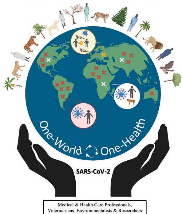
Figure 3. SARS-CoV-2 and the One-World – One-Health concept. It emphasizes that human health is dependent and intricately connected with that of animals (domestic and wild), birds and plants. A disturbance in the ecosystem results in human diseases (zoonotic or reverse-zoonotic). The letter X denotes a zoonotic event; the color red, white and yellow depict potential primary, secondary and tertiary zoonotic events, respectively.

CoVs have struck humans, and the probability of another one is quite certain. This scenario leaves no option other than adopting One Health-One World approach. It is worth noting that about 60% of known infectious diseases in humans are zoonotic and about 70% of emerging infectious diseases in humans are also of zoonotic origin [77]. Several factors may account for the increases in infectious diseases of zoonotic origin. They include climate change, urbanization, rapid population growth, expansion of new geographic areas, lifestyle changes, eating habits, intensive farming systems, deforestation, land use changes, increased human national and international travel, and increased movements of animals and animal products across the globe for trade. These changes affect human and animal health, and the ecosystems, resulting in rapid spread of infectious diseases. They increase the probability of SARS-CoV-2 jumping not only from animals into humans through primary and secondary zoonotic events, but also from humans to animals through reverse spread. They also enhance the potential for emergence of new genotypes, pathotypes and/or antigenic types of SARS-CoV-2. Because of the ability of the virus to infect multiple host species, it could be quickly shipped via asymptomatic human carriers, infected animals and/or food products from one location to the other.