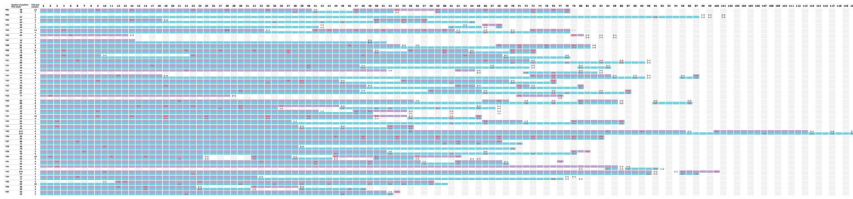
Figure 3. RT-PCR results of 37 COVID-19 patients with prolonged PCR positivity. The horizontal axis indicated the days after disease onset. PCR results of each patient (P01-37) were depicted by two lines of blocks. The first line of blocks indicated RT-PCR results from pharyngeal swabs, and the purple shade showed positive results. The second line of blocks indicated RT-PCR results from sputum samples, and the blue shade indicated positive results. The white zone in both lines indicated the time interval between testing negative for SARS-CoV-2 till the next positive testing. The total days of positivity and time of testing were also listed on the left of the figure.

In addition, all patients have been tested at least once after one month of infection for immunoglobulin G (IgG) and IgM antibodies against SARS-CoV-2 (Supplementary Table S2). Among them, 17 patients were tested twice during hospitalization. All patients were positive for anti-SARS-CoV-2 IgG at all testing points, ranging from 26 days to 101 days post symptom onset. In five patients (P3, P9, P11, P30, P36), sequential loss of anti-SARS-CoV-2 IgM antibody were observed mostly within the third month of infection, whose IgG antibody remained consistently positive in accordance to a post-infection status.