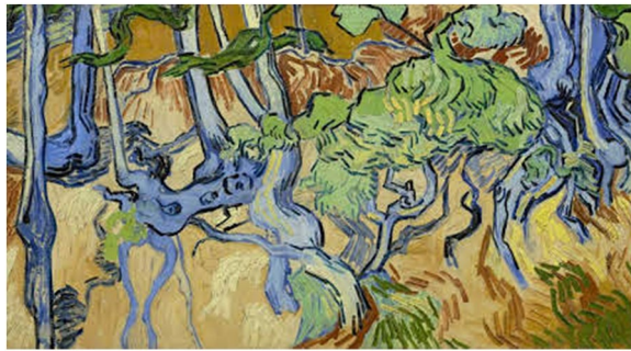
Fig. 4 Tree roots (July 1890), Van Gogh Museum, Amsterdam, The Netherlands