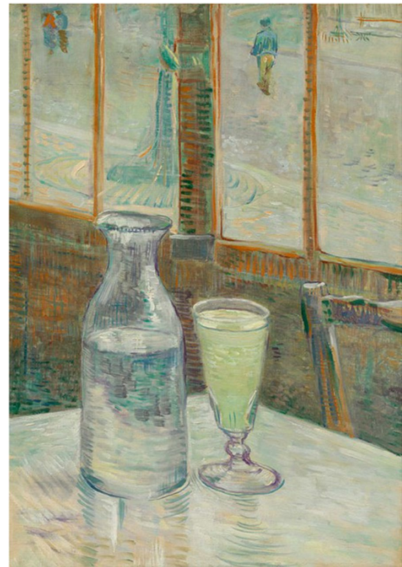
Fig. 2 Still life: Café table with absinthe (February/March 1887), Van Gogh Museum, Amsterdam, The Netherlands

Another suggestion was cycloid psychosis, characterized by confusion states, psychotic symptoms, mood swings, anxiety and psychomotor disturbances