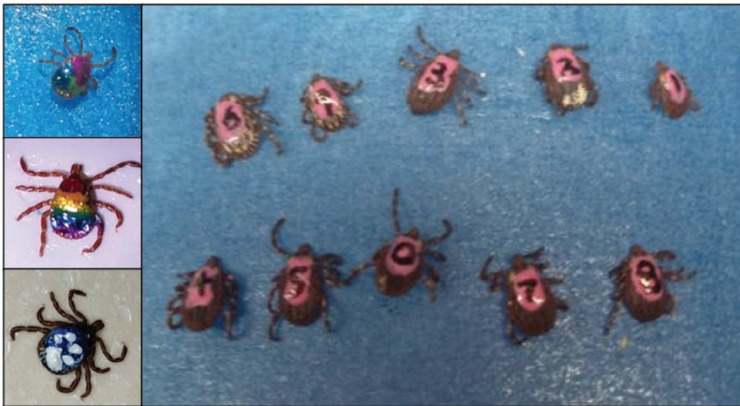
Fig. 3. Examples of painted ticks. Ticks can be painted with multiple colors to allow for notation of multiple recapture events. Ticks can also be marked as individuals using a fine-tipped marker over a light paint color.