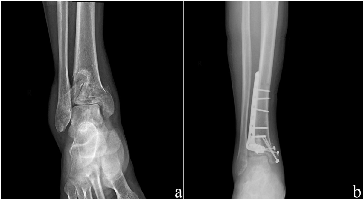
Figure 1. Preoperative (a) and postoperative (b) x-ray images of single step surgery.