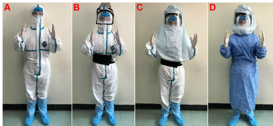
Figure 2 Participant's process of donning personal protective equipment. Two layers of personal protective equipment combined with powered air-purifying respirator (PAPR) (A): the protective cover-all with hood- Inner layer personal protective equipment, (B) Wear a PAPR, (C and D): Outer personal protective equipment with a hood PAPR.