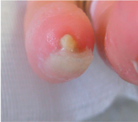
Figure 1c. Based on shape and consistency on palpation, calcinosis was classified as stone (palpable as a single stone or agglomerates of multiple stones of hard consistency).

clinical signs of local infection (erythema, smell, swelling, increasing pain), and compliance in administering local medication (scored as 0: no difficulty, 1–2: mild-moderate difficulty, and 3: incapable of administering medication).