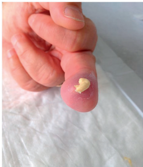
Figure 1a. Based on shape and consistency on palpation, calcinosis was classified as mousse (soft, chalky-like liquid underneath the skin).

Patient clinical data were carefully evaluated on the basis of individual medical records including demographic and clinico-serological findings, SU-calc features (shape, consistency, localization, presence of exudates, smell and/or other signs of infection), and radiological imaging of the calcinotic area. Calcium deposits were also classified according to their shape and consistency on palpation into mousse (soft, chalky-like liquid underneath the skin) (Figure 1a), plate (palpable as large uniform agglomerate) (Figure 1b) and stone (palpable as a single stone or agglomerates of multiple stones of hard consistency) (Figure 1c). All patients were treated with standard systemic therapy for scleroderma vasculopathy at the time of SU-calc presentation using one or more vasoactive drugs. Local treatment of single SU-calcs was carried out according to the wound bed preparation model, mainly based on the extent and depth of debridement of skin lesions. 2,11,19