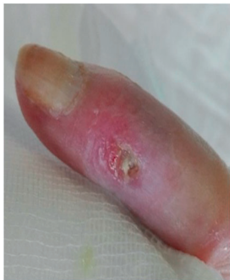
Figure 1b. Based on shape and consistency on palpation, calcinosis was classified as plate (palpable as large uniform agglomerate).

Each patient was also instructed to record the following data daily: pain level on a 0–10 severity scale (NRS: numeric rating scale), use of analgesics, adverse reactions to wound dressing, clinical features of perilesional skin (maceration, excoriation),