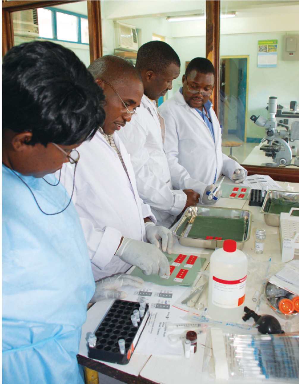
Laboratory personnel in Tanzania performing rabies diagnostic testing on animal samples. Separation of laboratory facilities for diagnostic testing of human and animal samples is costly and hampers the exchange of information and expertise needed for integrated surveillance and control of zoonoses