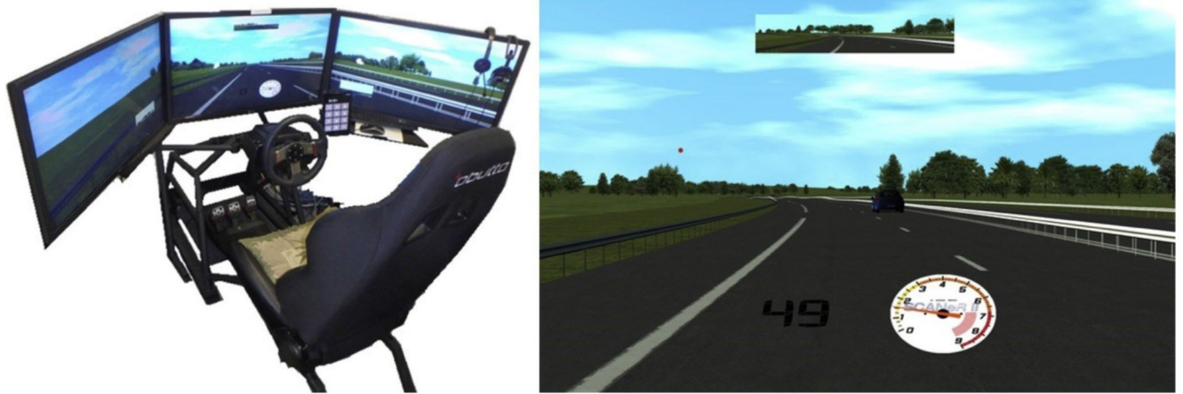
Figure 1. Driving Simulator Set-Up

Note. The left panel shows the driving simulator with the tablet device positioned next to the steering wheel. The right panel shows the central monitor view of the driving environment with rear-view mirror and digital speedometer displayed. 1