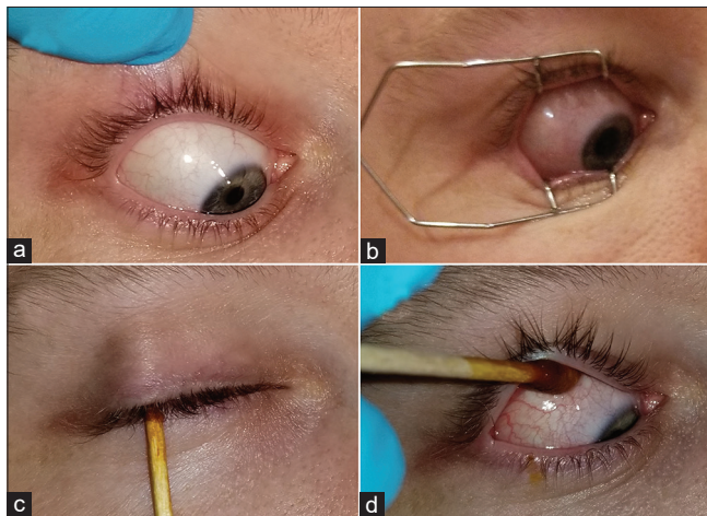
Figure 1: Methods of eyelid retraction. The unimanual eyelid retraction method consists of using one finger to manually elevate the superior eyelid (a). A speculum may also be used to retract both the upper and lower eyelids (b). The cotton-tipped applicator (CTA) method for lid retraction consists of using CTA soaked in 5% povidone-iodine and tetracaine placed in the lateral one-third of the eyelid (c). The wood handle remains unaided in place for 30 s, at which point it is used as a lever to elevate the superior eyelid away from the injection site and provide stability to the globe (d)

A total of 99 patients were enrolled (45 men, 54 women, mean age 64.5 years, range 47–88), with the manual, CTA, and speculum groups having 34, 32, and 33 patients, respectively. The mean pain scores for eyelid retraction with unimanual, CTA, and speculum groups were 0.788 (standard deviation [SD]