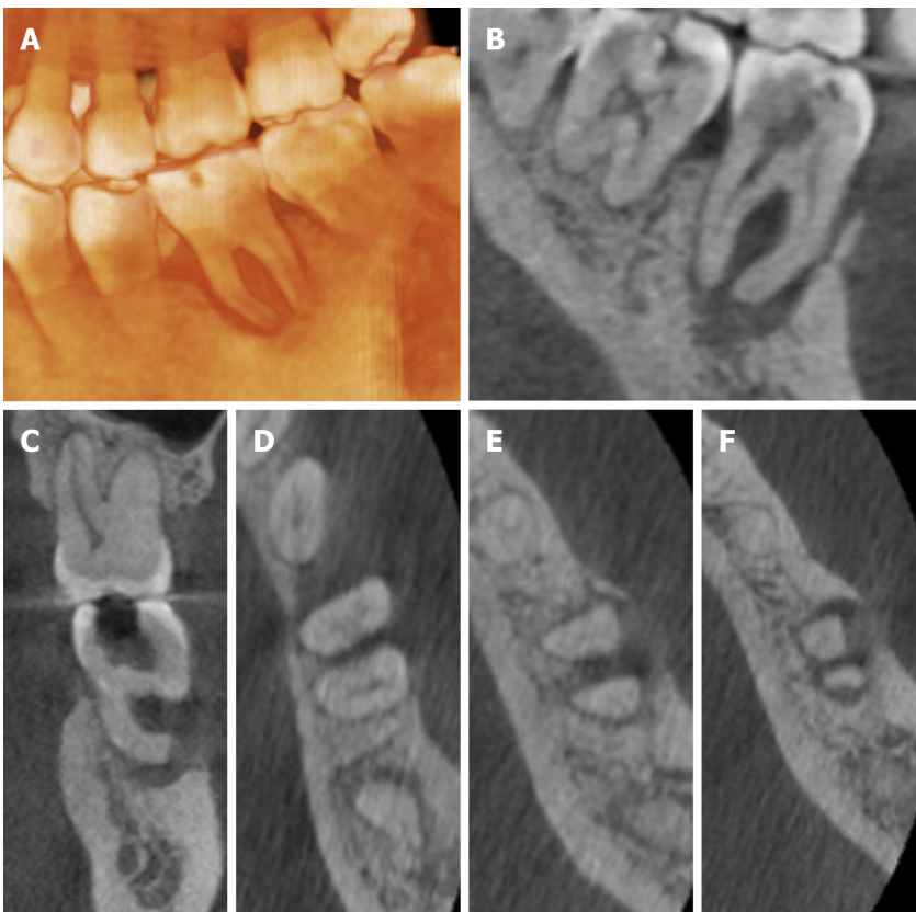
Figure 2 Images of cone beam computed tomography showing buccal, bifurcation, and apical bone resorption (A-F).