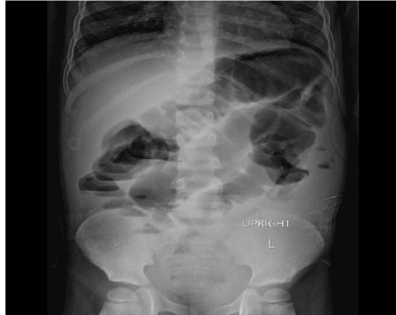
B. Abdominal x ray: There is no evidence of pneumoperitoneum.