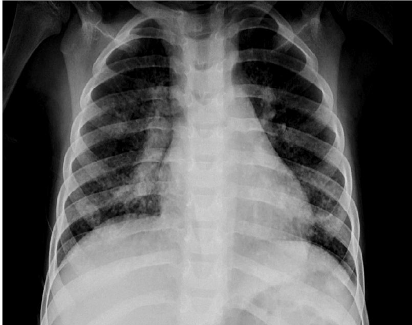
A. Chest X ray at: Prebronchial infiltration is seen bilaterally.