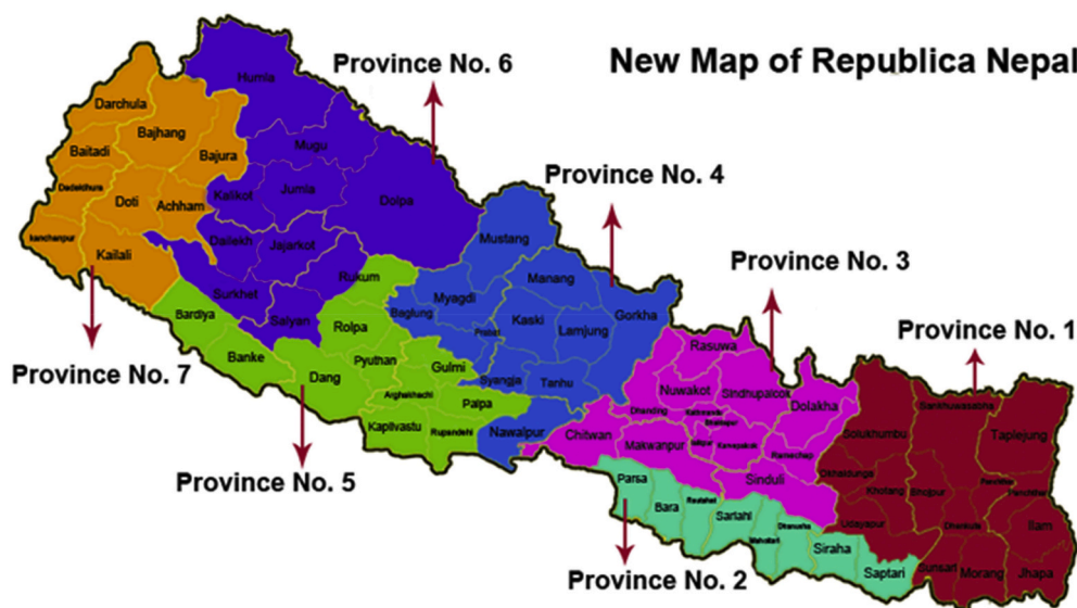
Fig. 1. Map of Nepal showing seven provinces and 75 districts (Province No. 6 is named as 'Karnali', No. 4 as 'Gandaki', No. 3 as 'Bagmati', No. 5 as 'Lumbini', and No. 7 as 'Sudur Pacchim'). The country runs from east to west with high altitude northern areas covering high hills and mountains, mid-altitude middle areas with mid-hills, and low altitude southern areas with plain lands called Terai.