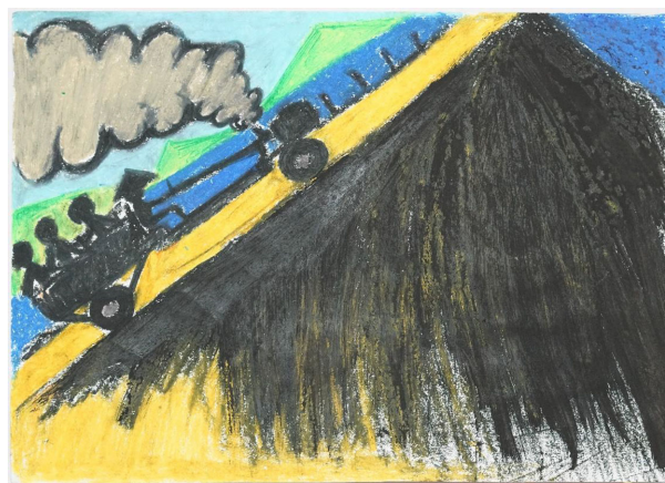
Figure 3. A drawing by the T-CAB members during a participatory visual workshop illustrating migrants' difficult journey to the clinic.

0012: I have to pick up my children, two of them. I need someone to help. I told [name of staff] that I cannot come...I have to pick up my children. She told me, please come, and I thought, not too bad, I can come but on one hand is my children. In the morning, I have to start cooking and at 7 a.m. I have to send them [to school]...pick them up