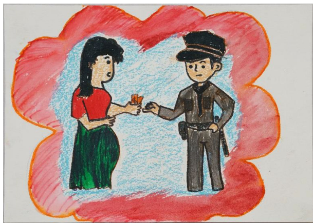
Figure 1. A drawing by the T-CAB members during a participatory visual workshop illustrating that many migrants have to spend extra money in the form of 'fees' or bribes to pass checkpoints.

Lack of education was seen as a root cause of ongoing difficulties finding stable work and providing for one's family.