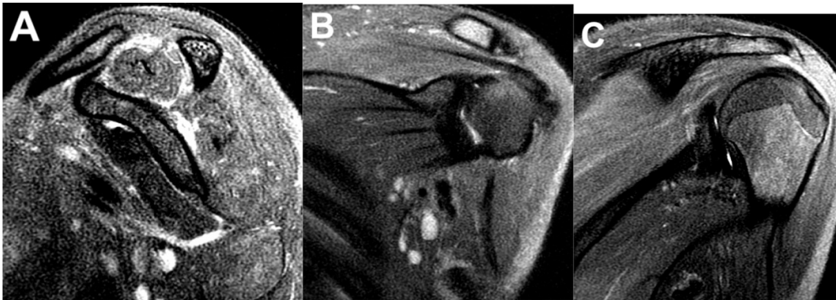
Fig. 1. Sagittal (A) and coronal (B, C) views of a fat-saturated T2-weighted sequence of the left shoulder demonstrates diffusely increased signal of the supraspinatus, infraspinatus, teres minor, teres major, and trapezius muscles.

However, recent viral illness and recent immunization are the most common associated risk factors, with cases reported in 25% and 15% of patients who developed PTS, respectively [6]. Given this relatively strong correlation, it is thought that PTS may result from a viral illness directly involving the brachial plexus or from an autoimmune response to a viral infection or antigen [1]. Various viral, bacterial, and fungal infections have been reported to precede PTS, including herpes simplex virus, Epstein-Barr virus, cytomegalovirus, varicella zoster virus, Parvo virus B19, Human immunodeficiency virus (HIV), Hepatitis B virus, Hepatitis E virus, Vaccina virus, Cocksackie B virus, and west Nile virus [7]. However, currently there are no reported cases of PTS in the setting of recent infection with SARS-CoV2 (COVID-19). We present a case of a patient found to have PTS shortly after proven infection with SARS-CoV2 (COVID-19).