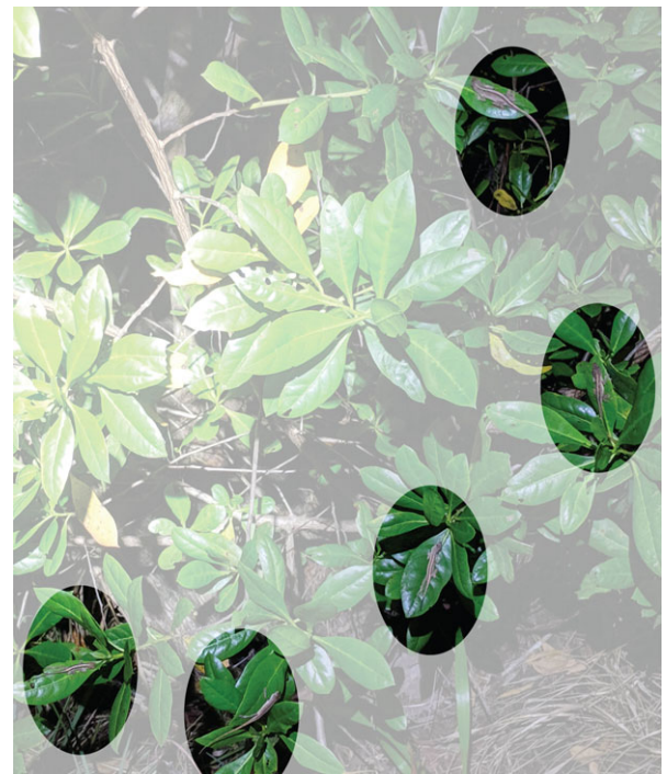
Figure 2. All diurnal lizards in this study sleep exposed on above-ground vegetation during periods of nocturnal inactivity. For example, here are typical sleeping site locations of Anolis sagrei in Miami, FL. Photo: J. T. Stroud, taken at 21.30 on 15 October 2019.

It is also possible that directional selection and physiological plasticity have both operated in our study. If species within this lizard community varied in their acclimation ability, as indicated by previous studies [14,40,42], then it is possible that plasticity may underlie extreme shifts in trait distributions of CT_{min} in some species, whereas selection is more plausible for others. For example, the post-cold event CT_{min} levels of brown basilisks ( B. vittatus ) were substantially below those of any individual measured prior to the cold event. Such a pattern suggests that it was highly unlikely that natural selection was responsible, and plasticity may have played a greater role than in other species where selective mortality of existing variation could explain the shift (e.g. Anolis spp.). We also observed high interspecific variation in CT_{min} prior to the cold event, as well as differences in habitat use and body size (figure 1), suggesting that species may have been expected to respond differently to an extreme event. However, we observed convergence among all species on a new, lower CT_{min} . While differences in ecology