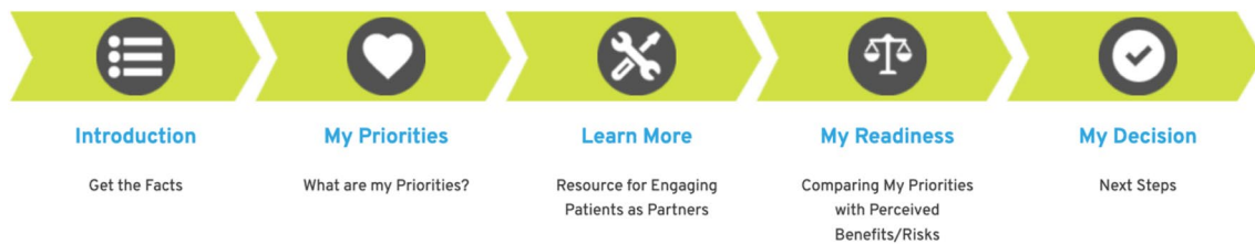
Fig. 3 Core functionalities of the patient and investigator decision aids