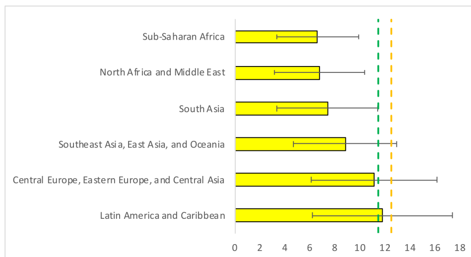
Figure 1 Estimated gestational weight gain in 2015 by Global Burden of Disease super-region. The green and orange dashed lines represent the minimum Institute of Medicine recommendations of total gestational weight gain for normal-weight (11.5 kg) and underweight (12.5 kg) women, respectively.

National estimates of the mean total GWG for each country in 2015 are summarised in figure 3, which shows the generally low levels of GWG in Africa, especially in