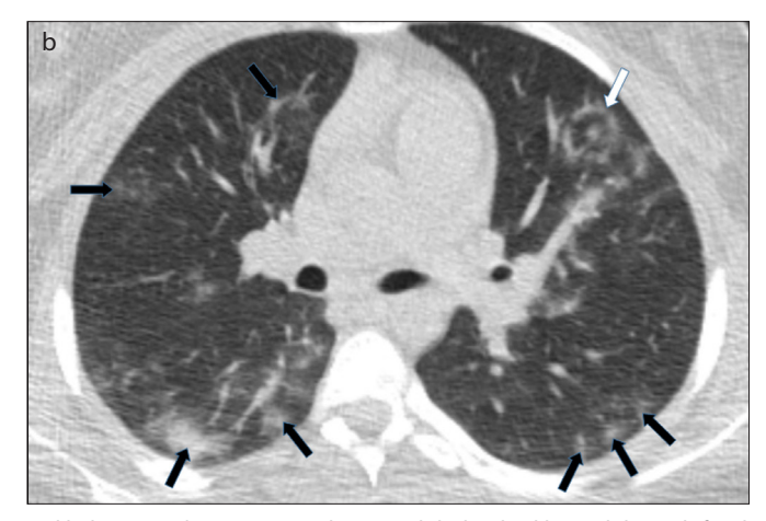
Figure. a, b. Axial thorax CT images (a, b) demonstrate multiple multifocal reversed halo sign (white arrows) with a centrilobular dot-like nodule. Multifocal peripherally distributed patchy alveolar infiltrations and ground glass opacities are noted bilaterally (black arrows).