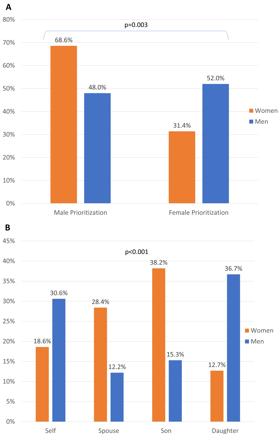
Fig. 2 a Distribution of Prioritization for Medical Treatment by Gender Prioritization in Lilongwe, Malawi, June–August 2017, b Distribution of Prioritization for Medical Treatment by Household Member in Lilongwe, Malawi, June–August 2017. Legend: Men (blue), Women (orange)

men and women reported that the money they earn is controlled by men in their households (72.5%). In multivariate analysis, longer transport time, indicating greater distance from Lilongwe, were associated with greater odds of reporting a woman as the small purchase decision-maker (OR