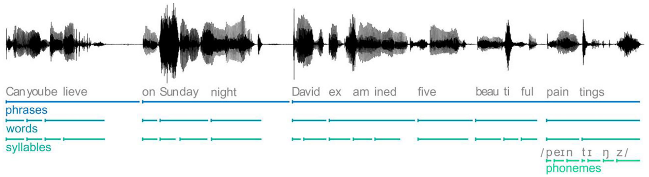
Figure 2. Example of speech as a carrier for linguistic units at different time scales from phonemes to phrases. From [23], used with permission.