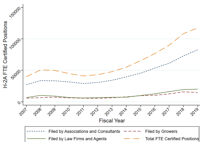
Figure 2 National total H-2A FTE applications and filer Type, 2007–2019 [Color figure can be viewed at wileyonlinelibrary.com ]

and consultants filed 70% of the applications for H-2A positions between 2007–2018.