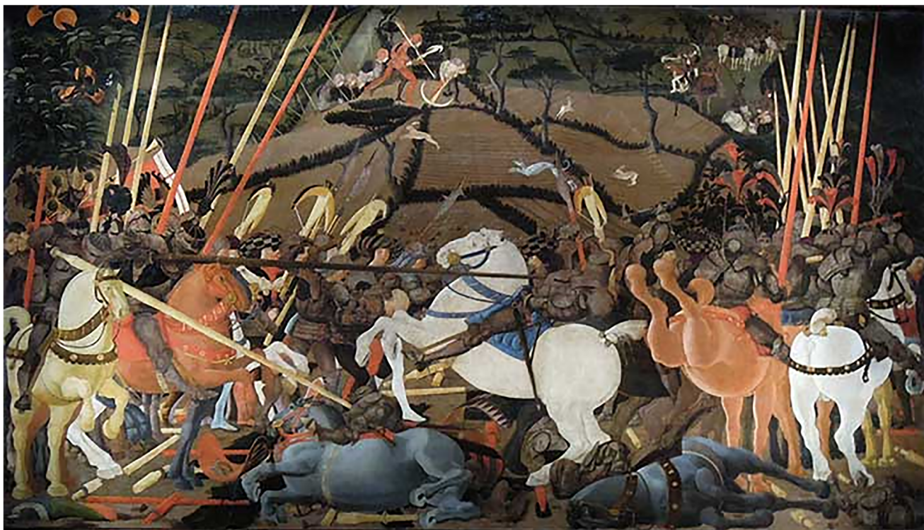
Fig 2 Battle of San Romano by Paolo Uccello (1397–1495).