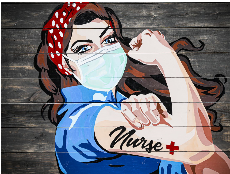
Fig 1 A mural near a hospital in Dallas pays tribute to nurses working during the coronavirus outbreak (Pandemics aren't wars: Vox).

White male political leaders like Boris Johnson, Scott Morrison and Donald Trump always relate the war against COVID-19 to World War II, a 'justified' war which united their people and