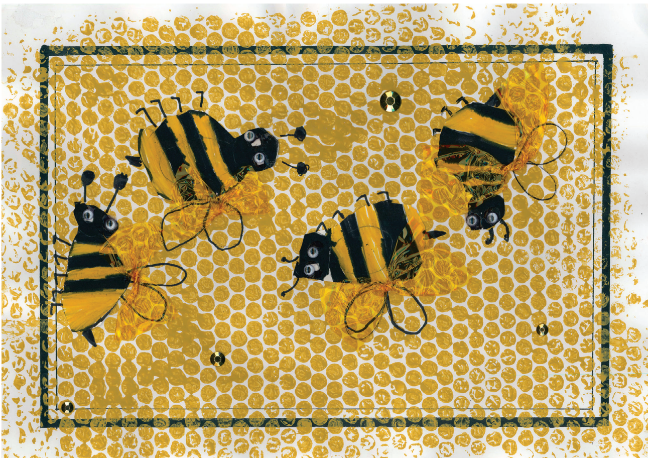
Buzz Buzz by Taylen Coventry (6) from Operation Art 2020