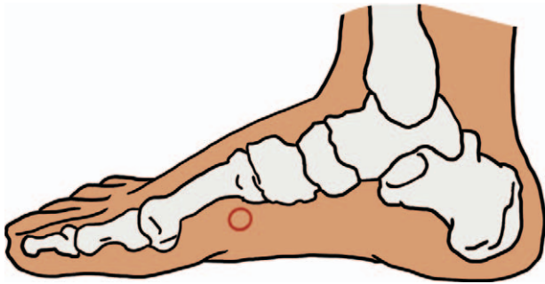
Figure 2. SP-4 (Gongsun) location.

levels will be measured by fasting blood sampling after 14 days of downregulation. After reaching the downregulation standard (B ultrasound monitoring follicle diameter < 5 mm; endometrial thickness < 5 mm; LH < 5 mIU/mL, estradiol < 50 pg/mL), the treatment with gonadotropin (Gn) (Gonafen, 75 IU/ dose, made by Merck serono) for 125 to 300 IU superovulation will begin. Gn dosage was determined according to the number of basal sinus follicles, the level of basal sex hormone, and the hormone level of 14 days. Gn was discontinued and HCG (produced by Zhuhai Lizhu Biological Pharmaceutical Co, LTD, Room 405, Administration Building, No.38 chuangye North Road, Jinwan District, Zhuhai City, Guangdong Province, China) was intramuscularly 5000 to 10,000 units when there was at least 1 follicle with a > diameter of 18 mm, or 2 or 3 follicle with a > diameter of 17 mm. After the injection of HCG for 34 to 36 hours, the eggs were obtained by vaginal puncture under the guidance of b-ultrasound.