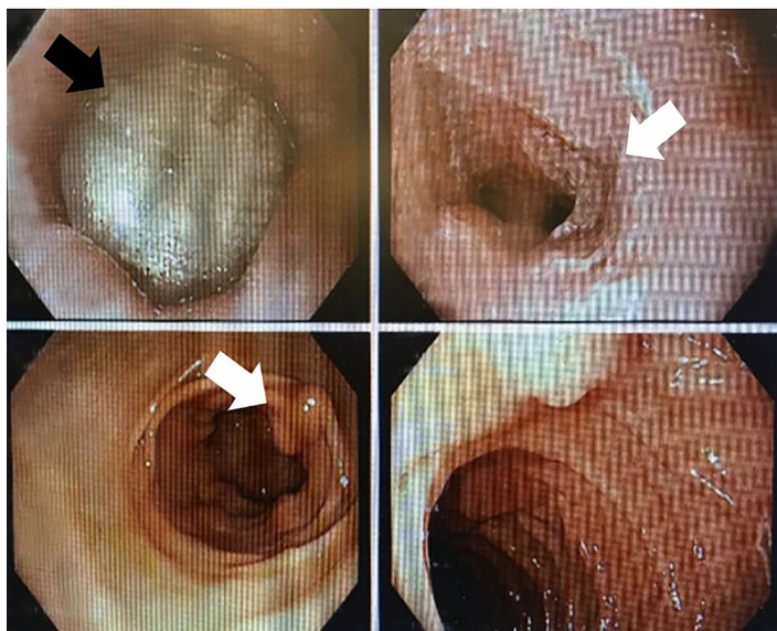
Image 3. Image of this patient's esophagogastroduodenoscopy with the foreign body in sight at the gastroesophageal junction displaying the esophageal strictures (white arrows) as well as the trapped desiccant canister (black arrow).

to avoid taking multiple medications at once without identifying them.