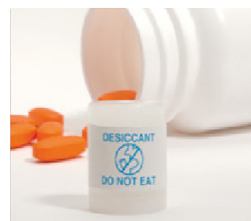
Image 1. (Left) Image of traditional desiccant package. 1 (Right) Image of new desiccant cylindrical canister for medications. 7