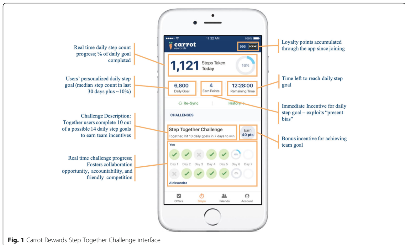
Fig. 1 Carrot Rewards Step Together Challenge interface

Chi-square and independent t-tests were conducted to examine group equivalency on demographic measures. Controlling for pre-intervention mean daily step count, ANCOVA was performed to examine group differences in intervention period mean daily step count. Data were expressed in estimated marginal means (95% CI). To complement the ANCOVA and increase internal validity (i.e. the extent to which causality can be established) in this quasi-experimental study a number of analysis phase strategies recommended by Handley et al. (2018) were deployed [49]. First, a pairwise t-test examined the mean daily step count change over time (pre-intervention vs. intervention) for each group. Second, ANCOVA and