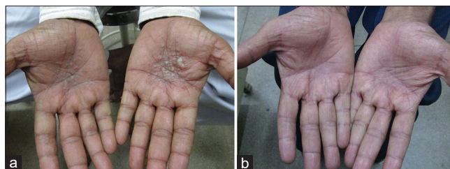
Figure 2: (a) A case of palmoplantar pustulosis. (b) After 10 days of Colchicine, 1 mg twice daily.