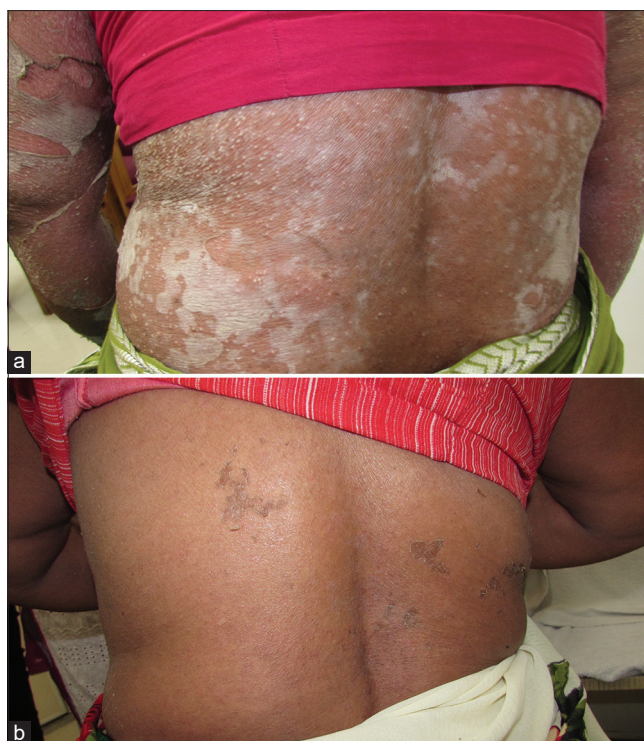
Figure 3: (a) A case of pustular psoriasis who relapsed repeatedly after taking methotrexate and cyclosporine. (b) A complete clearance of lesions after 10 days of Colchicine 1 mg twice daily

et al. [25] To date, few controlled trials of colchicine in the treatment of Behçet's syndrome have been carried out; but a single double-blind study comparing this drug with cyclosporine demonstrated that both medications were equally effective in reducing the symptoms [26] which makes colchicine a cheaper and safer option.