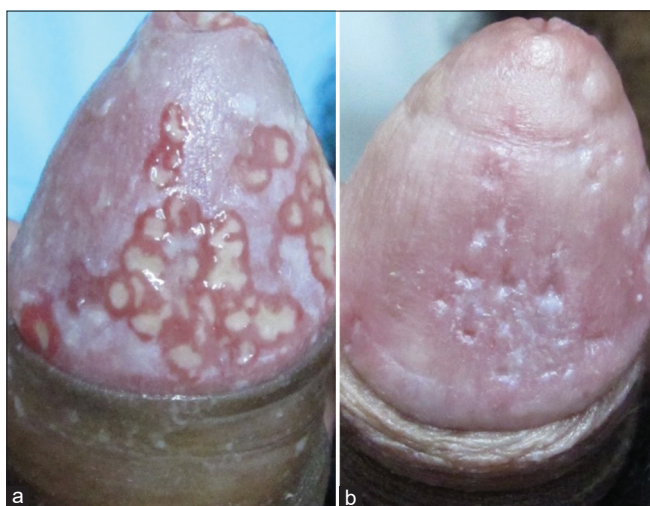
Figure 4: (a) A case of herpetiform penile aphthous ulcers misdiagnosed as herpes genitalis. (b) The same patient after 10 days of Colchicine 1 mg thrice a day. [50]

*Those underlined are serious side effects