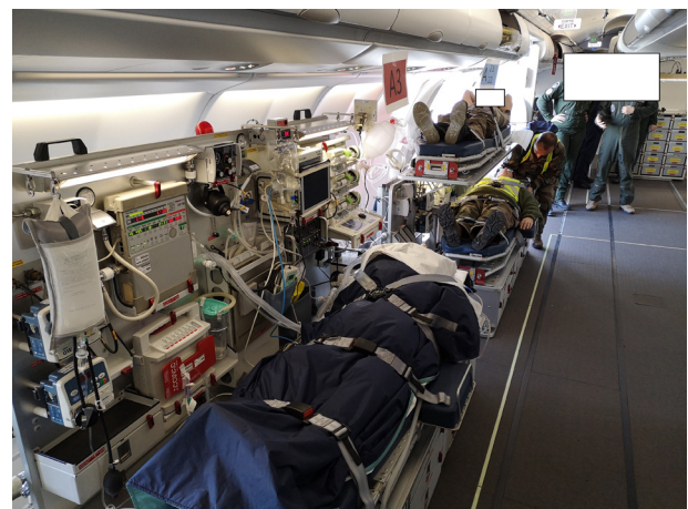
Fig. 1. Intensive Care Module of the MoRPHEE system.

The Charlson comorbidity index [10] and the Sequential Organ Failure Assessment (SOFA) score [11] were calculated for each patient before transportation. ARDS was defined and graded according to the Berlin definition [12]. Predicted body weight (PBW) was calculated according to the ARDS Network predicted