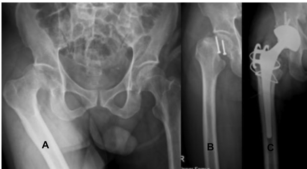
Fig. 2 (A) A 45-year-old man sustained combined right posterior hip dislocation with a femoral head fracture (Pipkin type I) due to automobile accident. (B) The fracture fragment was stabilized with two screws but avascular necrosis with nonunion occurred at 6 months. (C) Total hip arthroplasty was performed within one year.

Despite that FHF with or without a hip dislocation is a high-energy trauma, no patients died after arrival at our institution. Generally speaking, surgical outcome is better in types I and II as compared to types III and IV FHF regarding to AVN and HO [Table 2]. Although some articles encourage excision of fragment in Pipkin I fractures; in respect of maintaining joint congruency we generally performed ORIF for type I instead of excision and the clinical result seemed acceptable [3,10,25]. The incidence of AVN is still high in type III fractures and the majority of these cases need arthroplasty treatment later. Initial treatment with hip arthroplasty may be considered as another treatment option [2,28]. In this study [Table 2], AVN