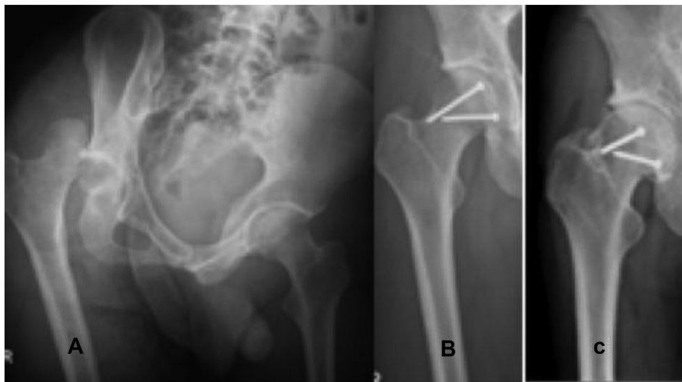
Fig. 4 (A) A 31-year-old man sustained combined right posterior hip dislocation with a femoral head fracture (Pipkin type II) due to motorcycle accident. (B) The fragment was stabilized with two screws. (C) Low grade of heterotopic ossification (class 1) occurred without symptoms for 3-year follow-up.

In the literature, type I or II FHF are favored by ORIF and excision of large fragments is reported to have poor hip function [3,29–31]. In the current study, ORIF for FHF in both types has introduced 17% (4/24) AVN and 38% (9/24) HO. The hip function was affected in 17% patients (4/24). Practically, this result may be acceptable.