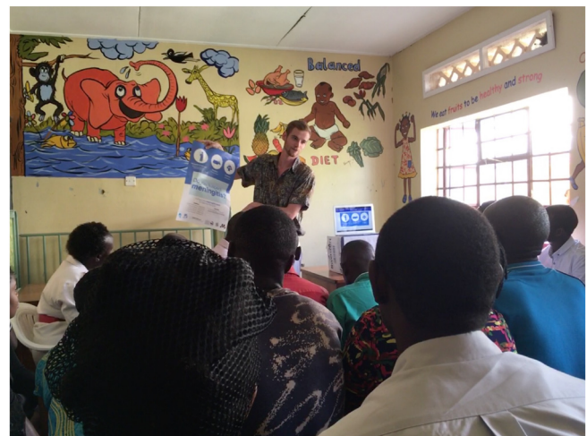
Figure 2. Knowledge exchange session in Western Uganda.

In this event the aim of meningitis research team was to transmit: engaging with hard-to-reach young adults who may be disengaged from HIV care or untested in order to raise awareness about meningitis, the safety of lumbar punctures and ongoing meningitis clinical research. Using a local social circus group, we attracted a large audience of around 250 people using