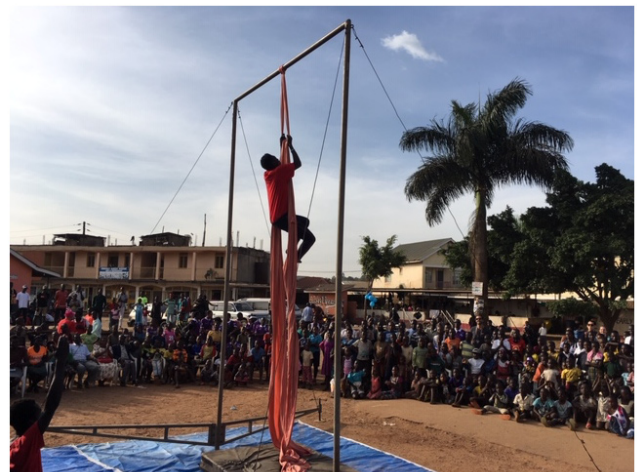
Figure 5. Public audience drawn to the circus event.