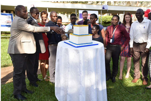
Figure 9. Cake cutting with the research team, study participants and IDI Executive Director.