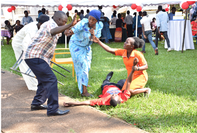
Figure 8. Dramatisation of meningitis illness by IDI drama group.

dances and a dramatization around meningitis (Figure 8) to address stigma and myths surrounding lumbar punctures and meningitis management ('collaborate'). A number of trial participants spoke about their experiences in clinical research. The event was also used as a platform to disseminate scientific results to trial participants and important stakeholders ('transmit'). The 'Journey of Hope' symbolised a very difficult journey for patients and their caretakers, many of whom had at times lost hope and were now celebrating with their families and former doctors, empowered to act as community advocates to improve understanding about advanced HIV. Attendees feasted and cut cake together to celebrate the progress made so far (Figure 9). We hope to repeat this successful event in the future on the completion of further clinical trials.