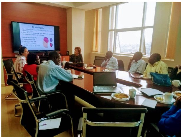
Figure 4. Infectious Diseases Institute Community Advisory Board Meeting.