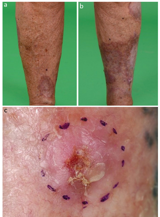
Fig 1. Clinical photographs showing chronic necrobiosis lipoidica. a) Chronic necrobiosis lipoidica in right leg. b) Chronic necrobiosis lipoidica changes more marked on the left leg. c) Area of chronic necrobiosis on the left lateral shin containing a 15 mm tender ulcerating nodule.

Necrobiosis lipoidica is a rare, chronic granulomatous skin disorder. Onset is often in middle age, and there is a female preponderance. 1 It is associated with diabetes in 11–65% of cases. 2 The pathogenesis is unclear. Typically, necrobiosis lipoidica involves the pre-tibial area; but may involve the scalp, face or upper limbs. Over time, the plaques flatten to form broad, yellow/