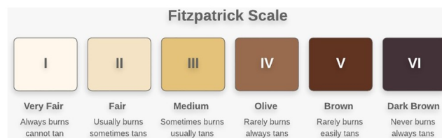
Fig 1. The Fitzpatrick skin phototype scale.

Skin colour was measured quantitatively using a handheld CM-700d spectrophotometer (Konica Minolta) with an 8mm aperture. Three measurements were taken from the inner surface of the upper-arm and automatically averaged to provide L^*a^*b^* values.