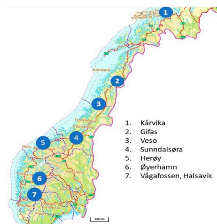
Figure 1. Location of aquaculture facilities where samples were collected.

The selection and composition of samples are presented in Table 2. We sought to represent the greatest variety of fish produced by Norwegian commercial aquaculture. The types of aquaculture facility (traditional flow through and recirculation land units, recirculating aquaculture system (RAS); large and small cage sea farms owned by the industry and research organizations) are listed in Table 2, and the geographic areas of Norway included in the study are shown in Figure 1. The production period ranged from the start of feeding to eight months in the sea. Sampling was performed within seven fully independent research projects approved by the Norwegian Food Safety Authority (approval codes 16,890, 11,814, 13,160, 8586, and 17,725) at eight sites located in different parts of Norway (Figure 1). All sampling procedures were carried out in accordance with guidelines from the Norwegian Food Safety Authority and the associated EU Directive 2010/63/EU guidelines for animal experiments. Samples of the head kidney, spleen, heart, dorsal fin, and gill were placed in RNALater (ThermoFisher Scientific, Waltham, MA, USA) and stored at -20^\circ\text{C} .