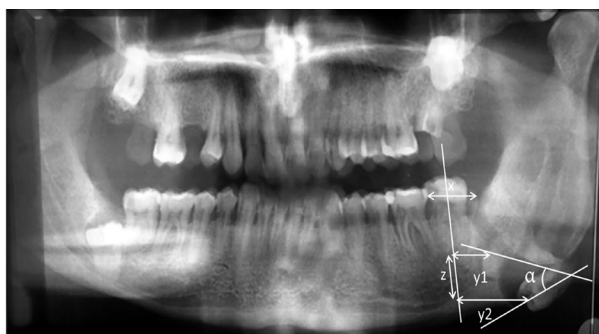
Fig. 2: Radiographic measurements.

using the Spearman correlation coefficient. For the relationship between radiographic and clinical parameters, the Mann-Whitney U test was used, with a significance value of p < 0.05 .