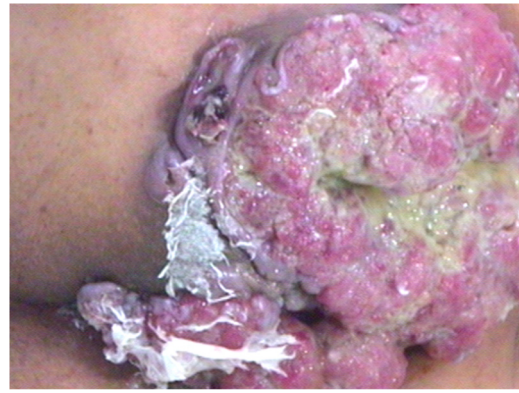
Fig. 3. Perianal mass. Two years later from initial visiting. Huge multinodular mass with mucinous material in anal canal with extension to the subcutaneous tissue and overlying skin.

adenocarcinoma. The initial serum carcinoembryonic antigen (CEA) level was 59.81 ng/mL. Patient underwent laparoscopic APR, and pathologic findings of the operated mass were reported as 7 cm × 4 cm × 3 cm well-differentiated adenocarcinoma arising in an anal fistula with invasion of perianal soft tissue and skin without lymph node metastasis (pT3 N0, LN = 0/18). The postoperative course was uneventful, and he was discharged without any postoperative complications. He had a favorable outcome without any evidence of recurrence or distant metastasis, at 3 years of follow-up.