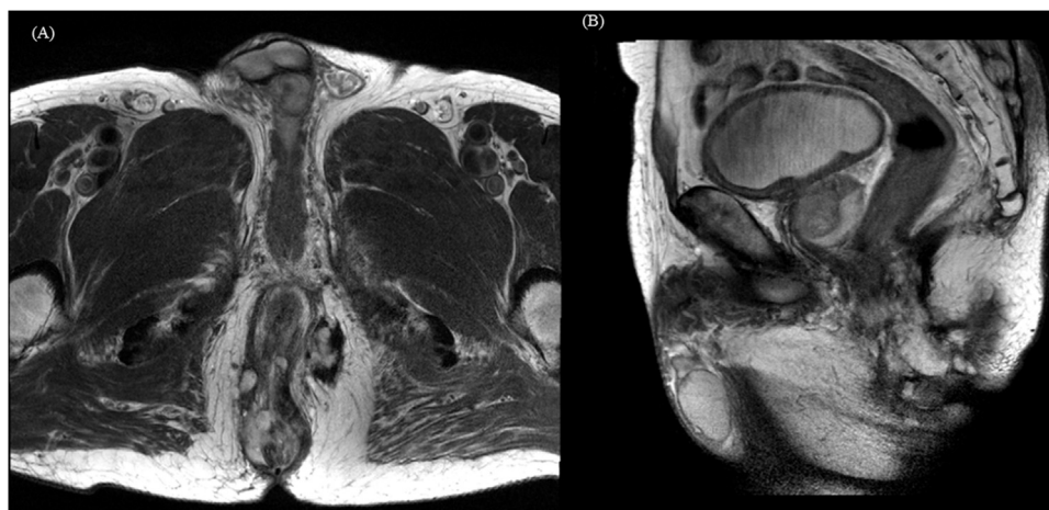
Fig. 2. Magnetic resonance image (MRI) findings. MRI showed perianal fistula and associated perianal multifocal abscess cavity. There was no evidence of lymphadenopathy in perirectal space, both internal iliac vessel area. (a) T2 weighted Magnetic resonance imaging. Axial view. (b) T2 weighted Magnetic resonance imaging. Sagittal view.

Although anal fistula is a common benign disease in coloproctology, perianal adenocarcinoma associated with chronic fistula-in-ano is rare, and has been reported in approximately less than 200 cases in the literature [8]. Therefore, there has been no definitive consensus on the pathogenesis, diagnosis, and treatment