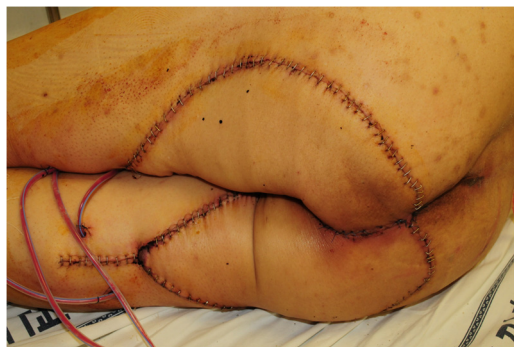
Fig. 5. Postoperative wound. Bilateral V-Y advancement flap.

(b) T2 weighted Magnetic resonance imaging. Sagittal view.