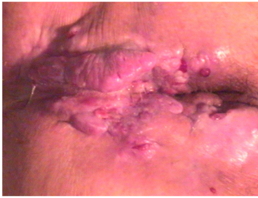
Fig. 1. Perianal mass. Large, irregular perianal ulcerated mass with multiple fistula tracts.