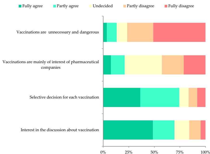
Figure 2. Distribution of vaccine hesitancy determinants.

More than two-thirds (69.7%; 95% CI 64.5–74.4) of the participants completely or partly agreed in having “interest in the discussion about vaccination”, 15.9% (95% CI 12.4–20.2) completely or partly disagreed and 14.4% (95% CI 11.1–18.6) were undecided (Figure 2).