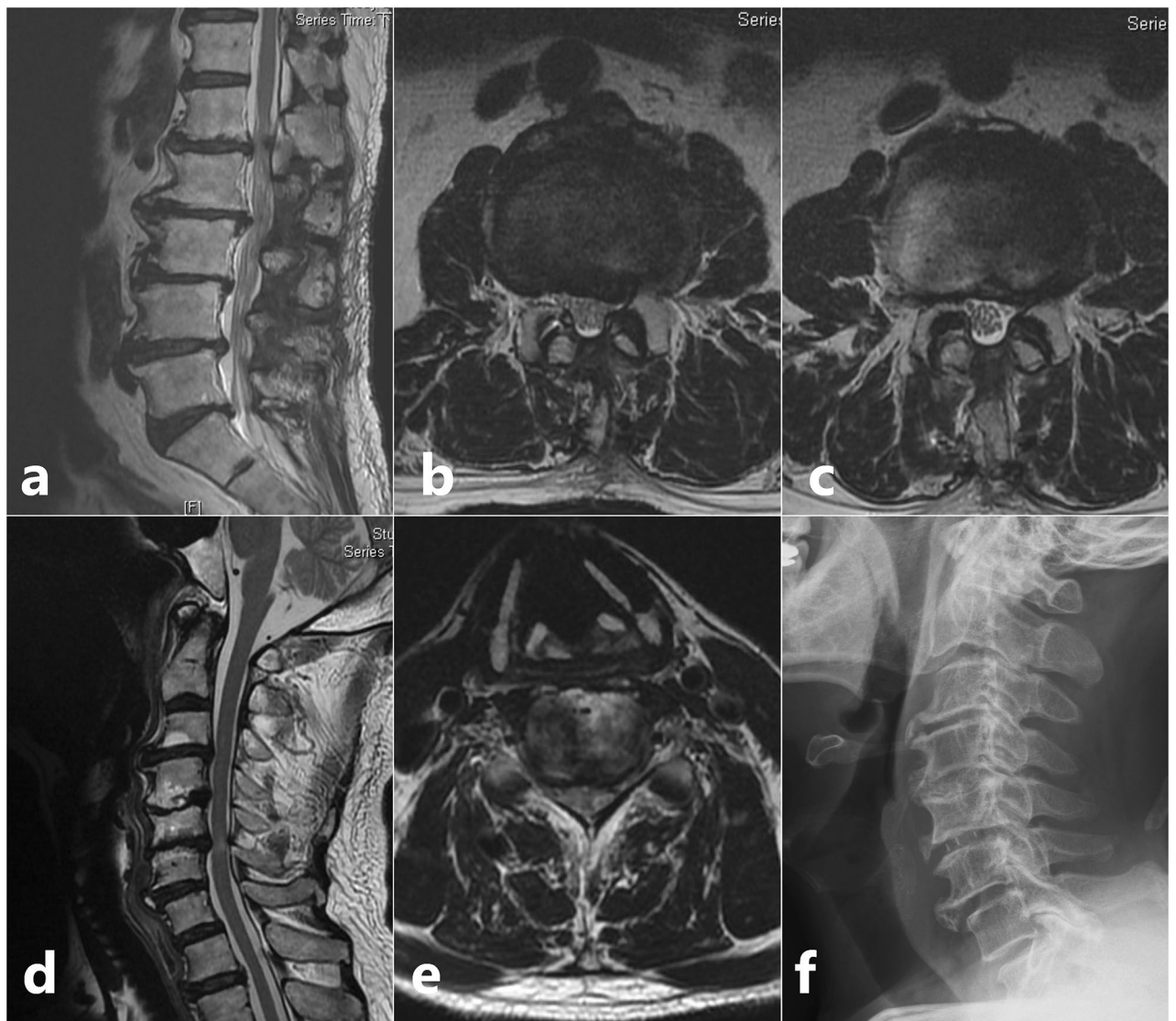
Figure 2. Scenario of a patient who had previous lumbar surgery but later diagnosed to have category 1 signs and radiologic evidence of a cervical pathology and was grouped under Tandem Spinal Stenosis. (a) Sagittal T2 weighted MRI of lumbar spine showing degenerative spondylosis; (b,c) Axial T2 weighted MRI of L2–L3 and L3–L4 levels showing the previous splitting laminectomy done for decompression; (d) Sagittal T2 weighted MRI of cervical spine showing degenerative spondylosis extending from C3–C6 levels; Stenosis causing signal intensity changes in the cord at C5–C6 level; (e) Axial T2 weighted MRI of C5–C6 level showing apparent stenosis; (f) Post ACDF lateral view X-ray image with PEEK cage at C5–C6 level.

during early stages 19 . Nagata et al. described that even physical performance decrease could be an early sign of cervical myelopathy that can manifest without the presence of any other classical sign 20 . This was evidenced by measuring the performance of lower extremities such as sit to stand time and one-leg standing time 20 . It is considered that the subtle weakness of lower extremity is beyond the measure limits of clinical evaluation and requires help of an instrument such as a manual dynamometer and/or by doing an electrophysiological study. Given that it is difficult to evaluate such complaints objectively, making a diagnosis of myelopathy demands a high index of suspicion 4 . This was the scenario in most of our patients, where SLLW was the only complaint which affected their daily activities.